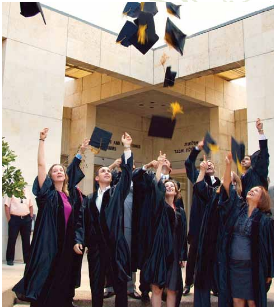
The postgraduates at the traditional “throwing the hats”...