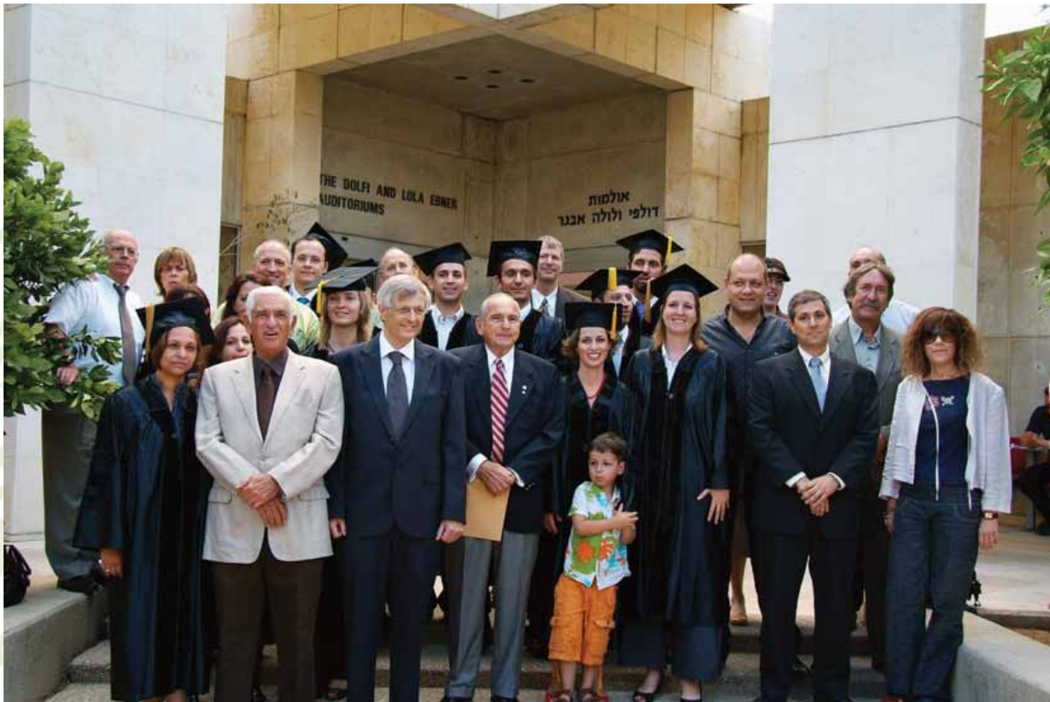
The postgraduates and the Department of Orthodontics staff